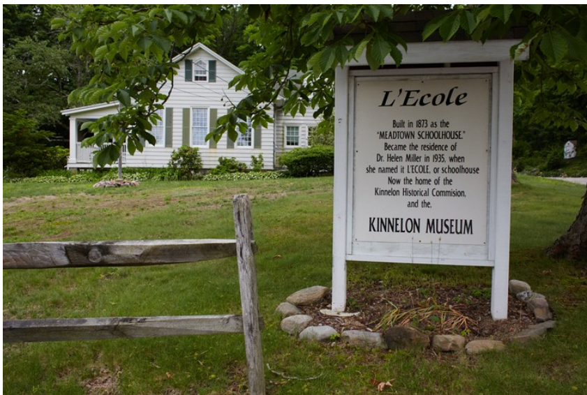
L'Ecole, the Kinnelon Museum, houses the Kinnelon Historical Commission.