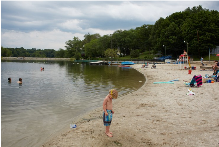
The Fayson Lakes Association in Kinnelon, N.J., offers beach access to residents.

$350,000. The association offers its residents beach access and annual events including a Fourth of July parade and a fishing derby.